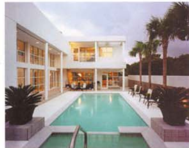
Graham Residence

living, dining and kitchen/den areas on the first level with the master suite and private study on the upper floor. A roof level sundeck overlooks the beach beyond.