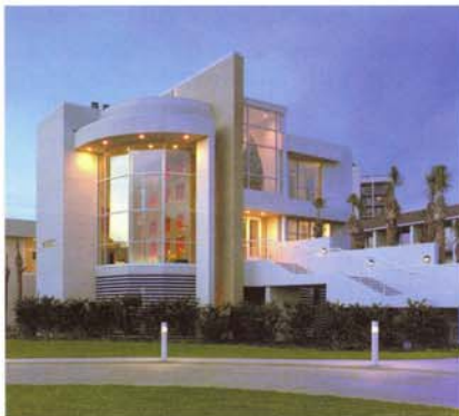
Davis Residence

The lower living level of the home is elevated 16+ feet above natural grade to meet flood plain requirements. The mass of the house is divided into two cubes connected by a glass bridge. The rear contains a garage/storage area below with two bedrooms and bath/laundry areas above. The main house contains the